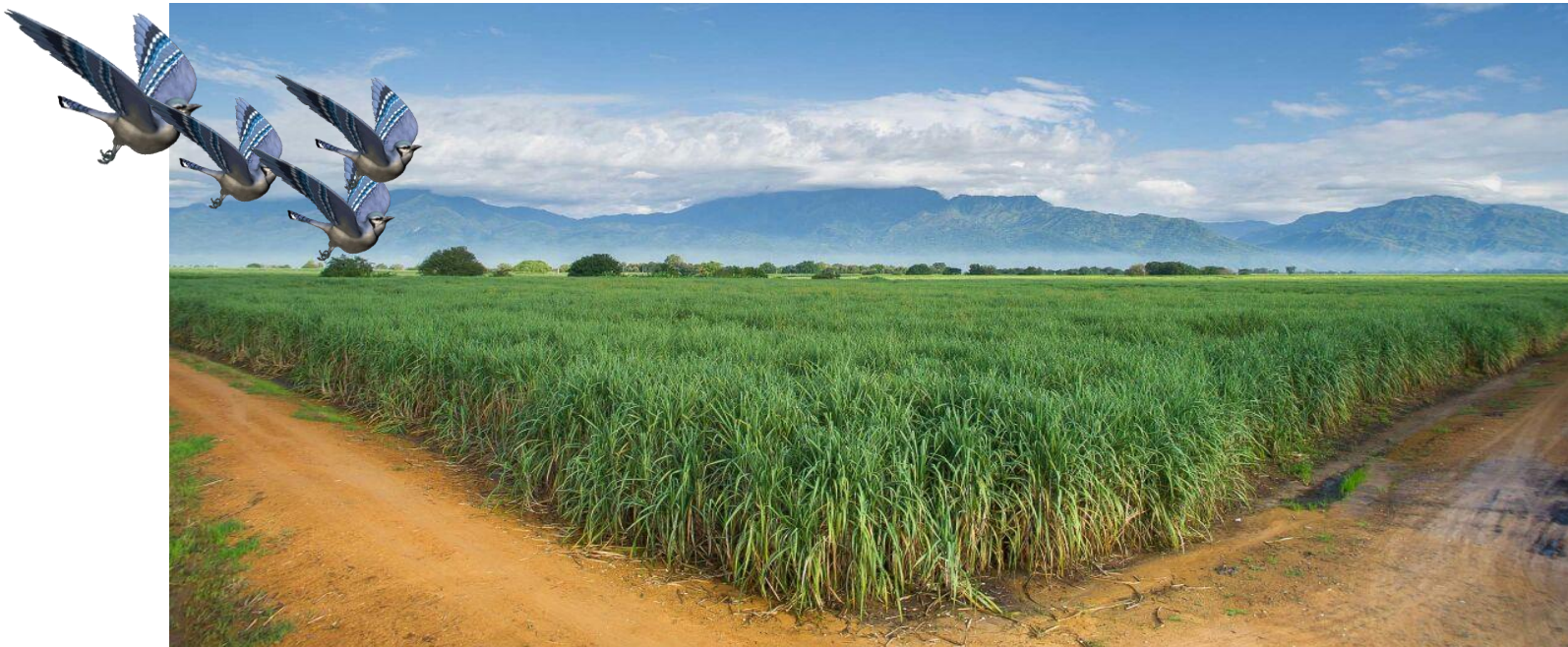
ILOVO SUGAR CANE PLANTATION

The district has limited number of Industries Developed. The main significant Industries are ILOVO sugar factories which process sugar and cane spirits, sisal fibres factories of Kimamba, Rudewa and Msowero and small scale Industries under indigenous people.